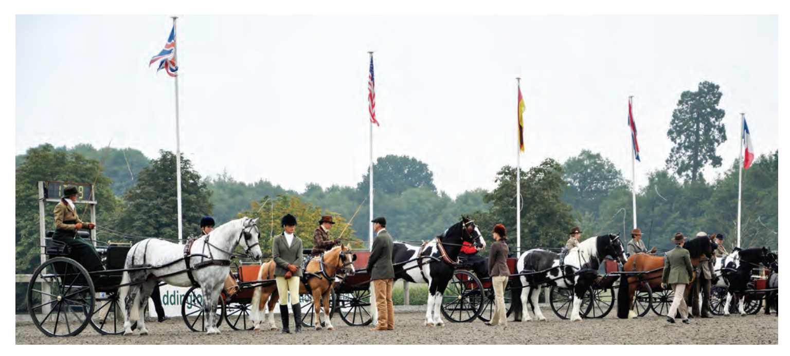
The line up, everyone await for instructions from the ring steward

to wear one on the carriage and if acting as a groom for any BDS class."