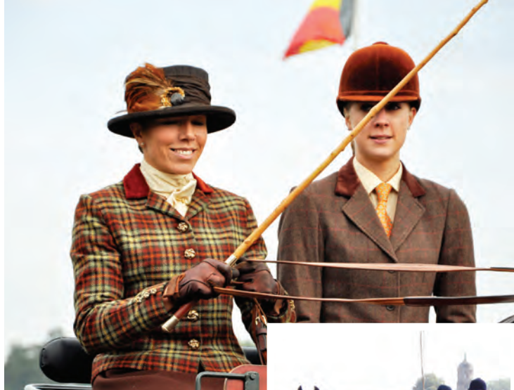
Colour coordination is key

"Think about colour coordinating both the driver and groom, and spend some time looking at the detail. Jackets can be picked up in charity