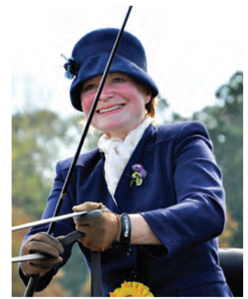
Remember to enjoy yourself and have fun

When driving across the diagonal, lengthen the stride whilst remaining straight and be aware that judges will be watching and are looking for