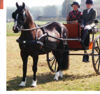
Colour coordination is key

"With regards to driver's headgear, I would suggest a felt type hat, nothing over the top. My current hat is an Ebay find, so again, you don't have to spend a fortune. As a backup plan, have your wet weather outfit packed in your lorry, i.e. wax hats and matching wax jackets.