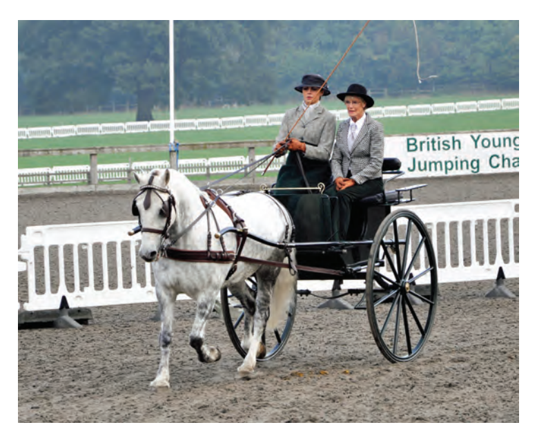
The driver shows good whip handling skill and coachman driving

practising the individual show to help a student prepare and build confidence in advance of their first competitive class.